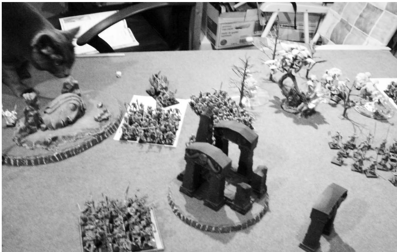
General Ramona Fluffles, right-hand aide to Admiral Giggles McFancy pants, plans the battle the night before hostilities began.

Memorial services for students and cats alike will be held, along with a ceremonial Triumph Vodka burning, at midnight Tuesday in Anticlimax Square.