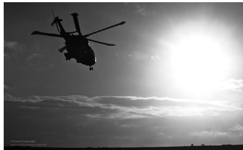
Black helicopter spotted over Brandonunia recently. Rumoured to be the private helicopter of Gen. Giol Vaulter.

These rumours coincide suspiciously with information leaked from within the Ministry of Peace. Memos from ministerial desks hint at upcoming offensives directed against various