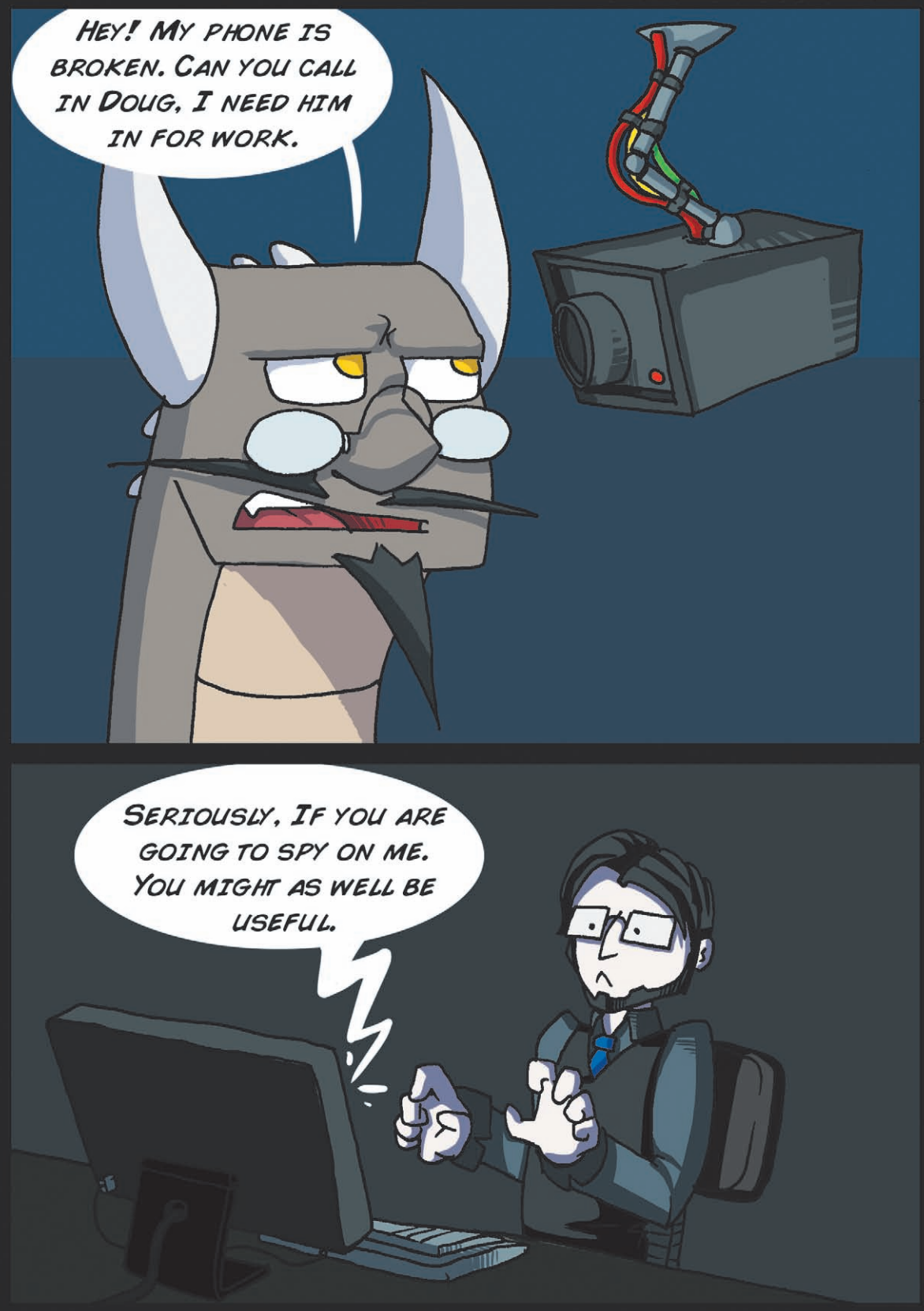
BY: DAKOTA BICKLMEIER