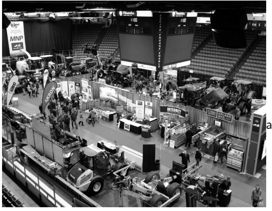
Ag Days

Email eic.thequill@gmail.com to have your events listed in the paper!