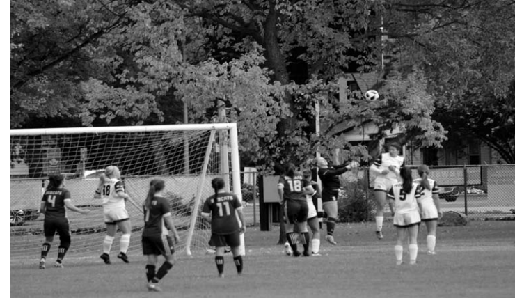
Bobcats Corner Kick.

15 th at 3:15pm they’ll be facing Saint Boniface followed on the 16 th at 3:15pm they go up against Assiniboine Commu-